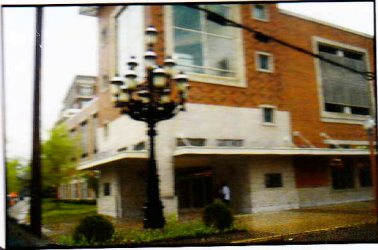
Argyle Building / Library